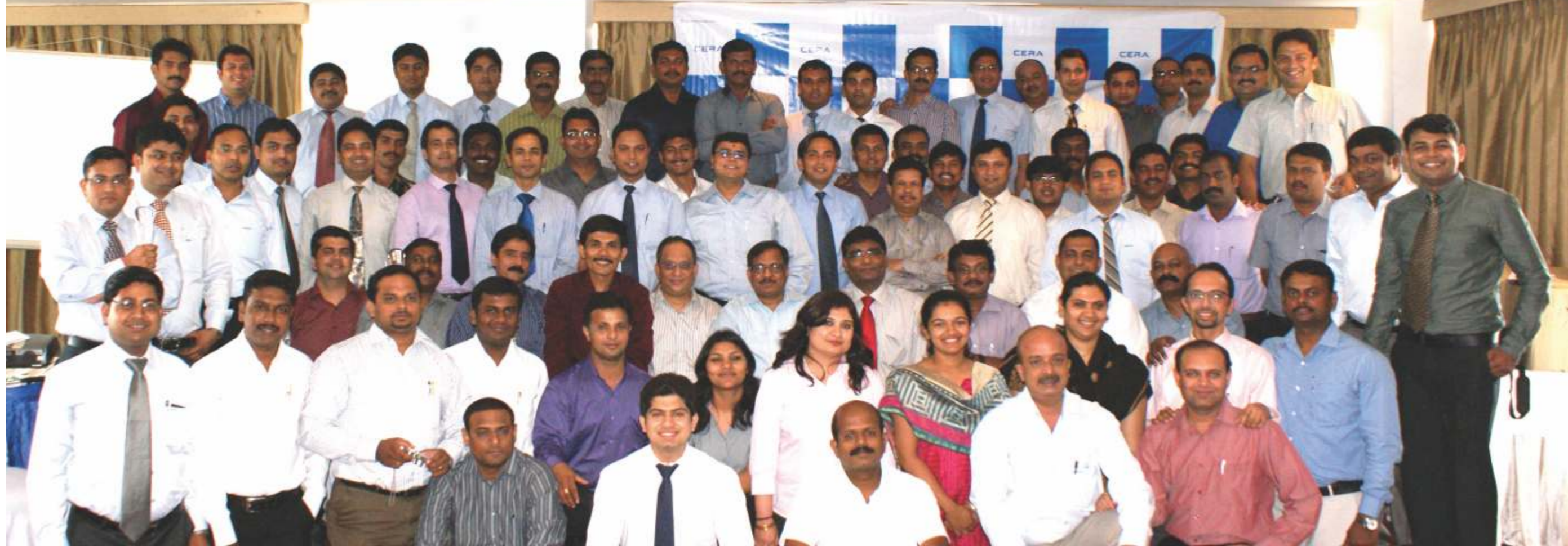
Mission accomplished: Team CERA at Colombo.