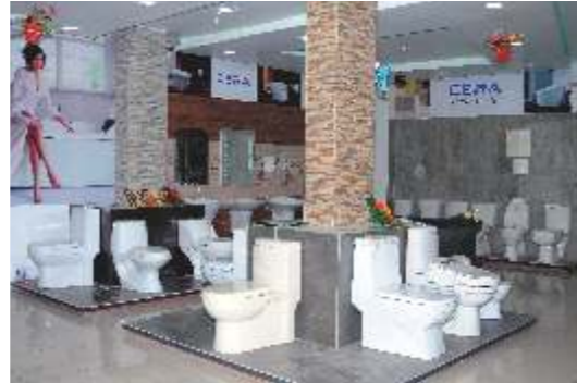
A view of the display at CERA Style Gallery in Guntur.