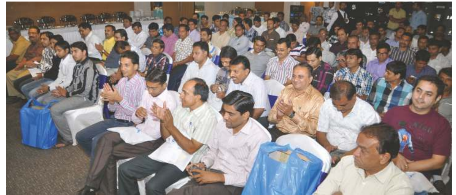
CERA retailers at the meet in Surat.