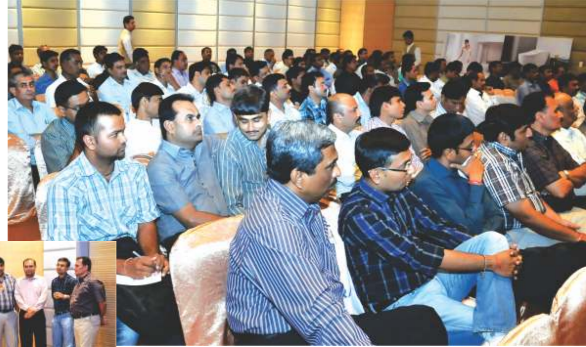
A view of the gathering of CERA retailers during the meet.

CERA retailer meets were held in Ahmedabad, Vadodara and Surat recently. Those who achieved the targets were also rewarded.