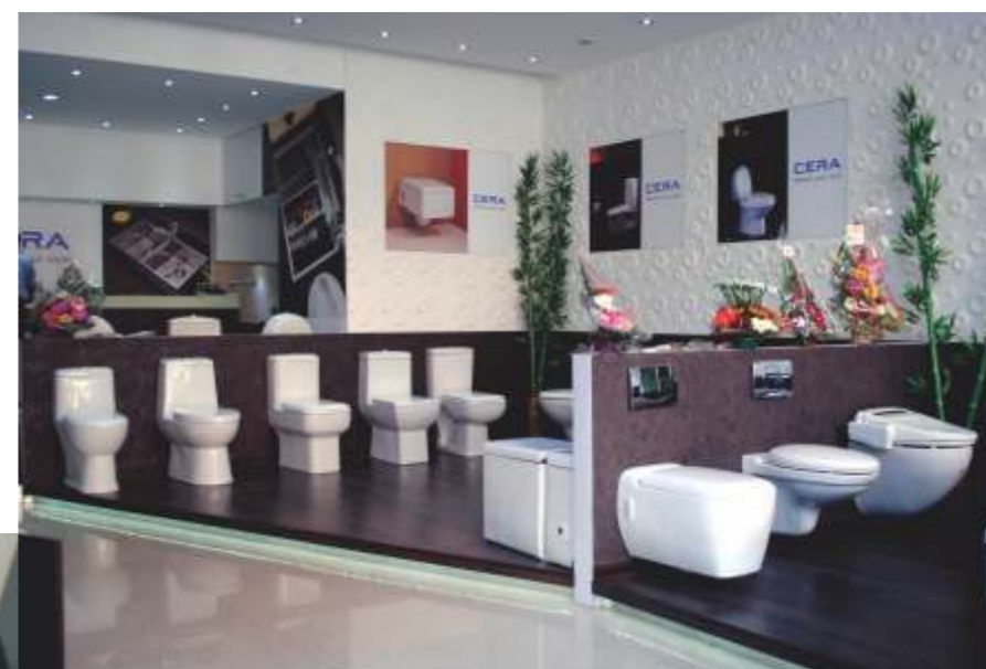
A view of the display at CERA Style Studio in Mumbai.