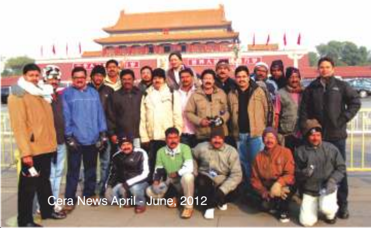
Cera News April - June, 2012