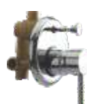
CQ 435 High flow single lever concealed diverter system for spout and overhead shower