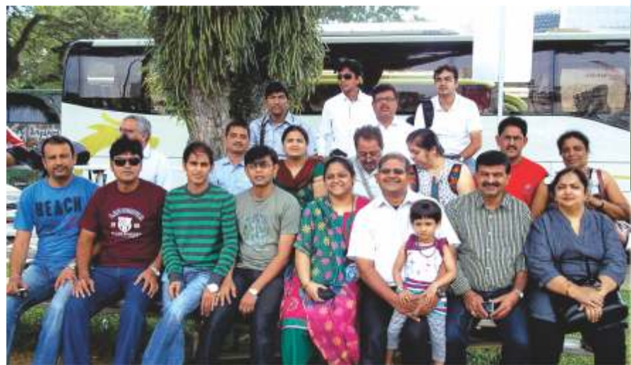
CERA Goa dealers during their trip to Singapore.