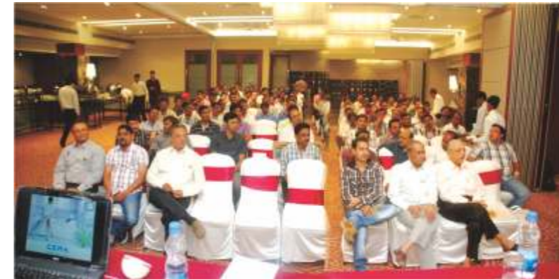
A view of the gathering at the CERA retailer meet at Vadodara.