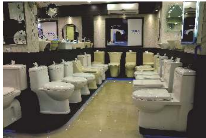
A view of the newly opened CERA Style Gallery in Thiruvananthapuram.